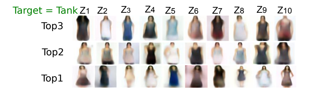
Figure 3: Top3 and top2 were able to capture the right category, the decoded images contain the target "Tank". However, due to wrong prediction for top1 resulted decoding looks like a "Dress".