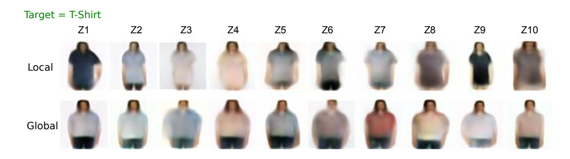
Figure 5: Example image used in our second user study. For each category, users need to select between local and global decoded target. Local method encodes the gaze data using gaze-pooling layer which benefits from user intended local image regions.

also connects to the analysis performed on the recognition task for the gaze pooling layer in [1]. We ask how much of a difference these approaches make in terms of search target reconstruction.