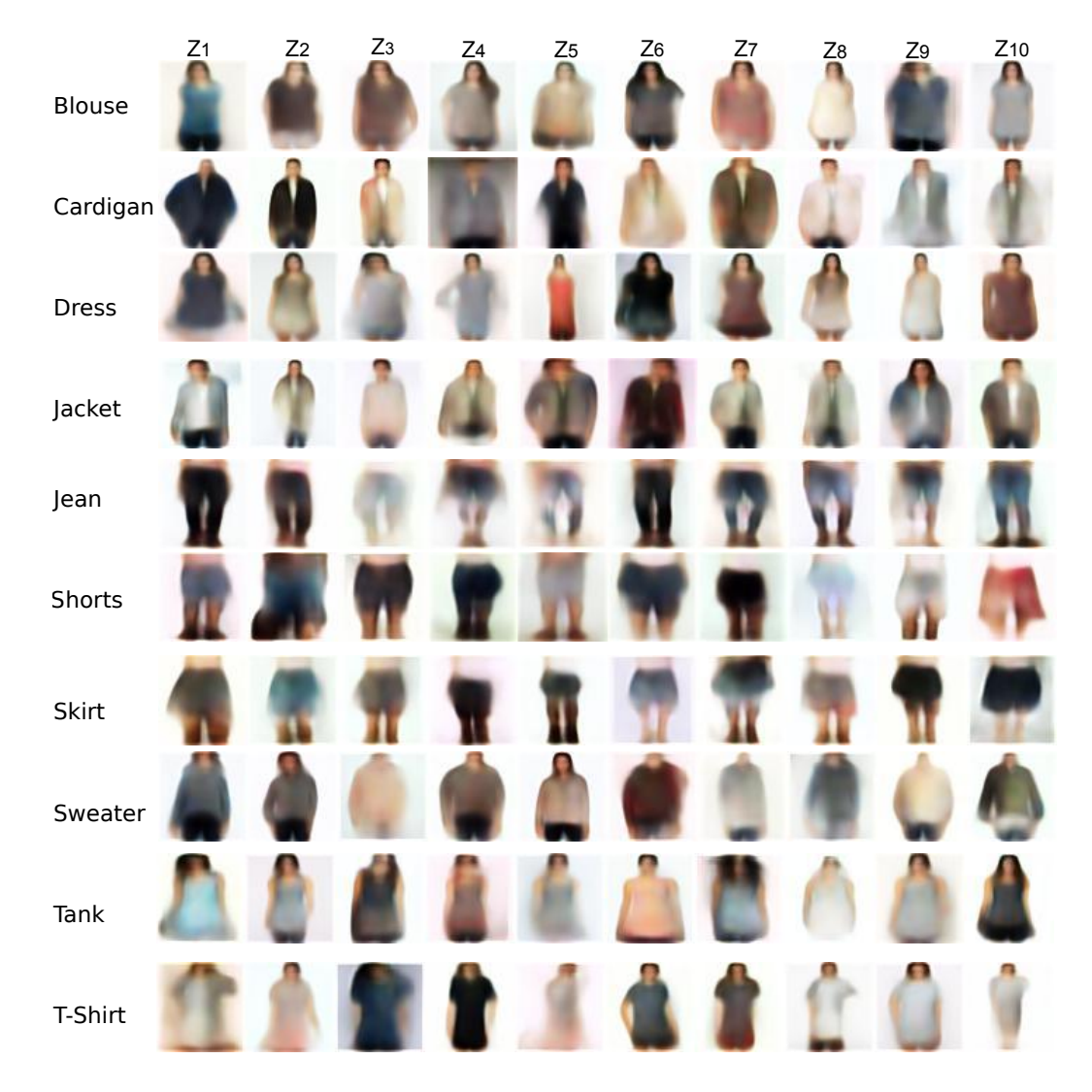
Figure 4: Each row is the decoded search target of a user for the given category using only top2 posteriors. Each column is for different samples of z from a normal distribution. As one can see the decoded search targets are distinctive from one another and they represent their corresponding categories properly.